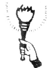
Martanda "Touch the Perfection"